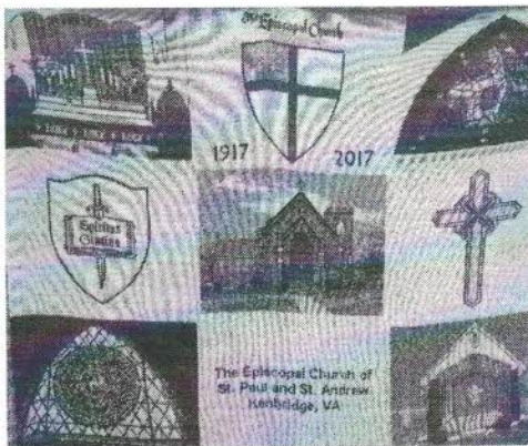
Afghan = $49.00